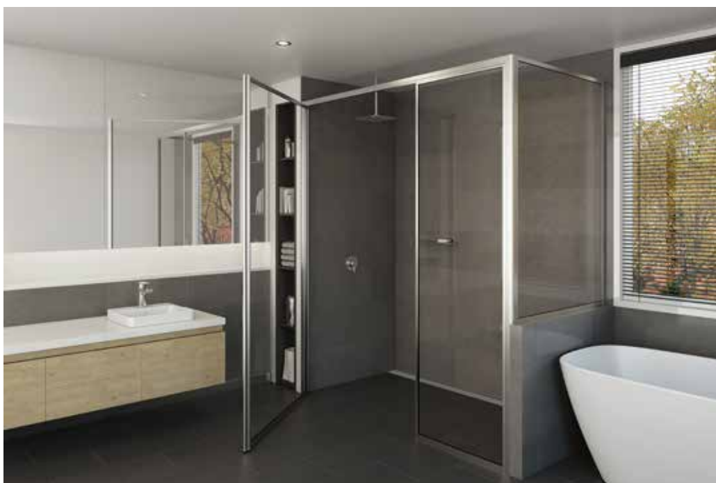
Affinity 18 Fully Framed Shower

The Affinity fully framed system is patented and manufactured from the highest quality brass, stainless steel pin and nylon insert. The Affinity full opening pivot inserts into the back edge of the door, ensuring a full opening door for all shower screen applications.