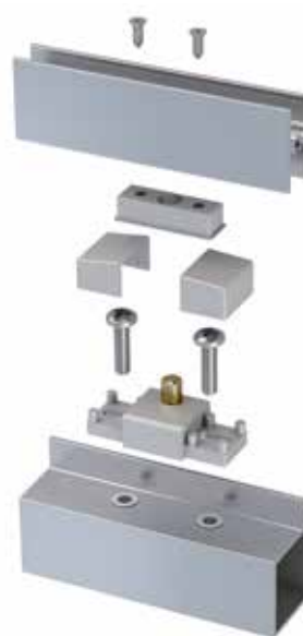
Exploded view of Fully Framed Pivot

Custom made to order fully framed, semi-frameless and frameless shower screen kits available, discuss further with your Area Manager.